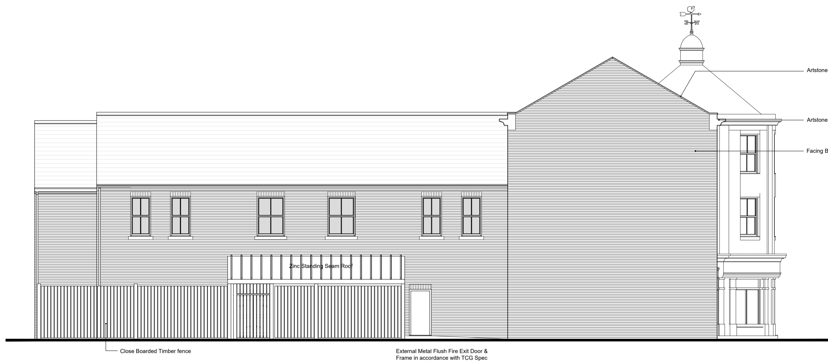
UNIT 1 WEST ELEVATION - 1:100 AS PROPOSED