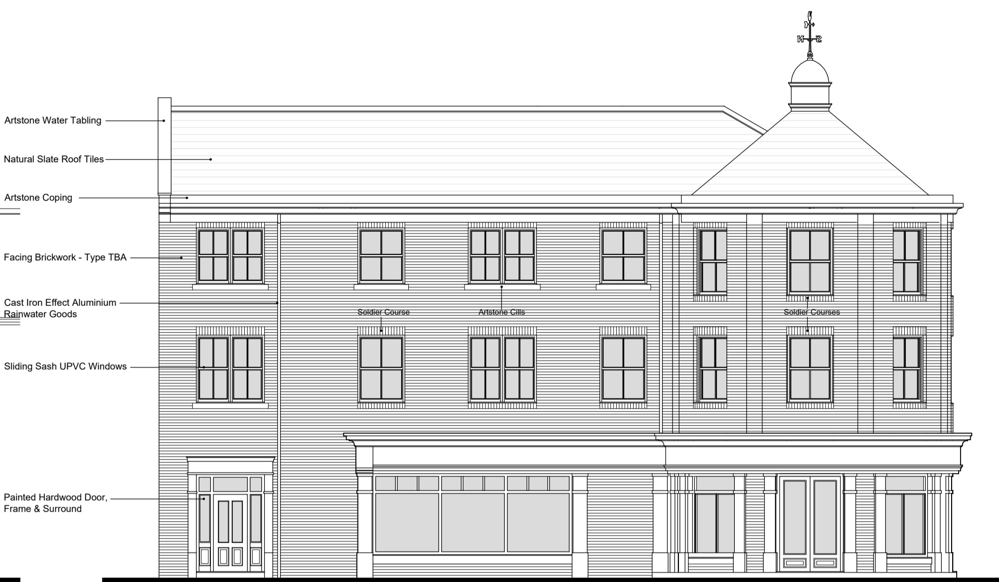
UNIT 1 SOUTH ELEVATION - 1:100 AS PROPOSED