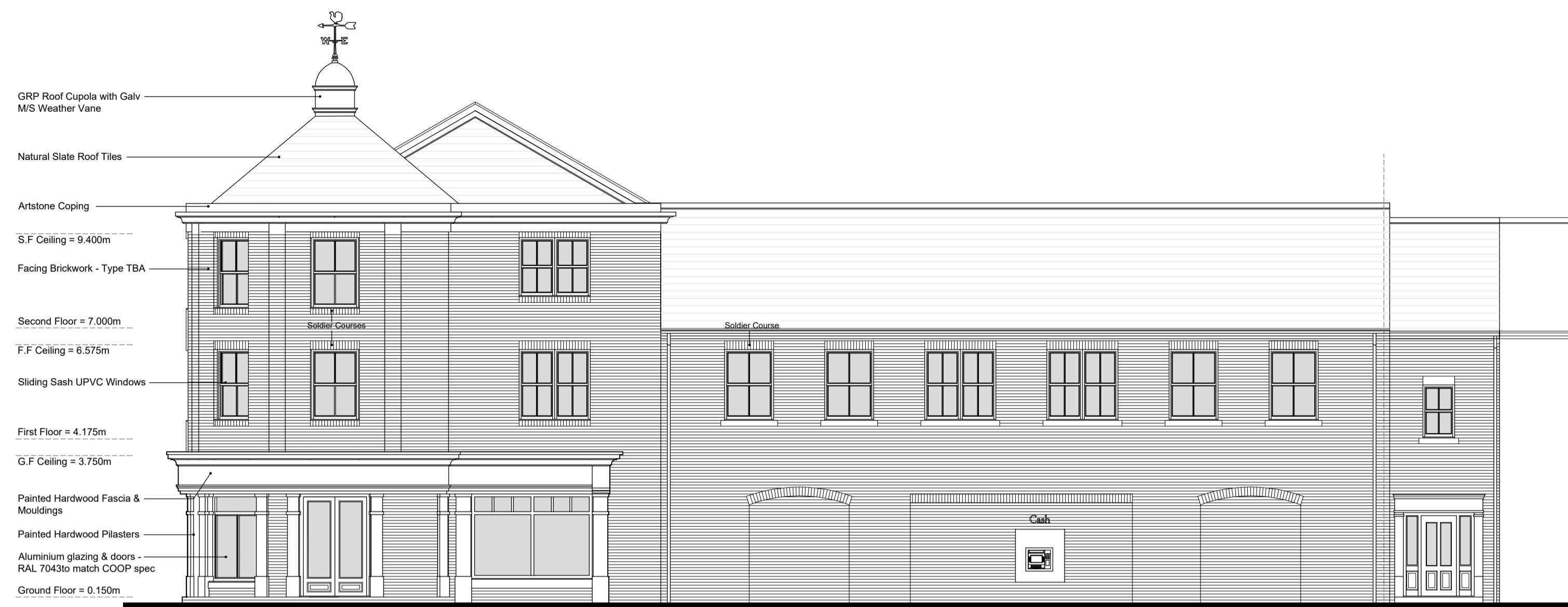
UNIT 1 EAST ELEVATION - 1:100 AS PROPOSED